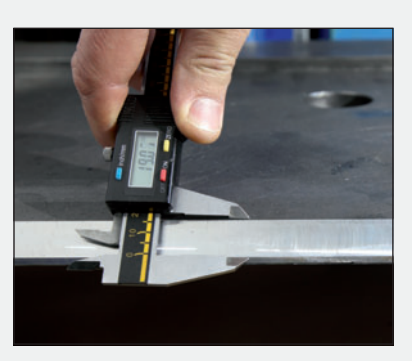
Chamfer width 30 mm max.