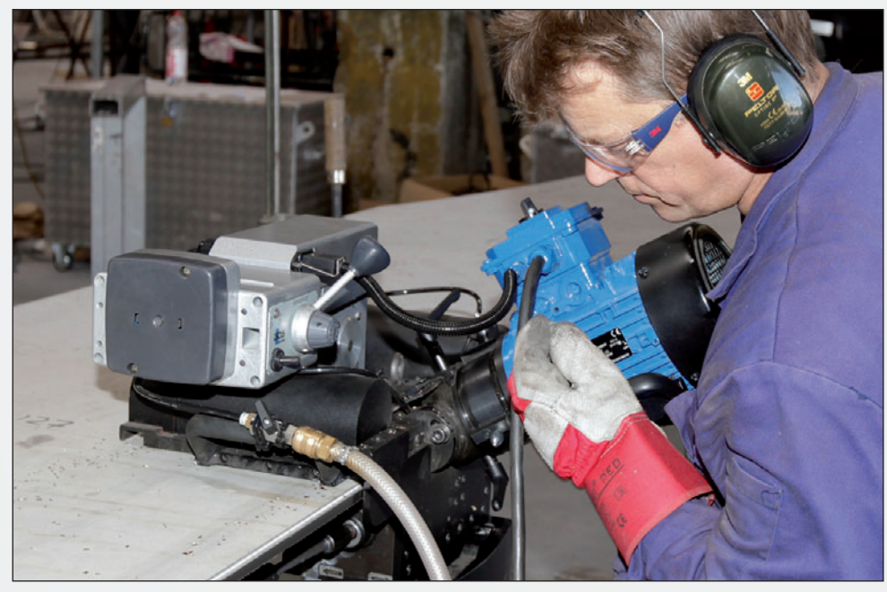
The AutoCUT 500 with automatic forward and return