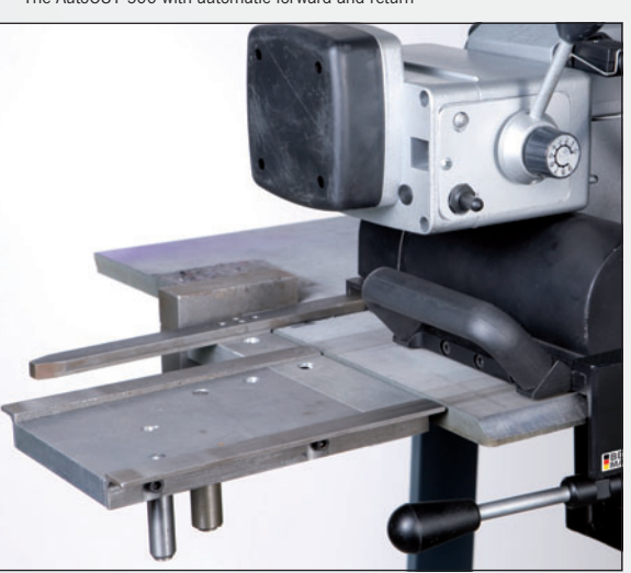
AutoCUT 500 guide rails