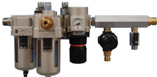
Existing Part number: 21222A Air regulation and filtration unit (ARF)