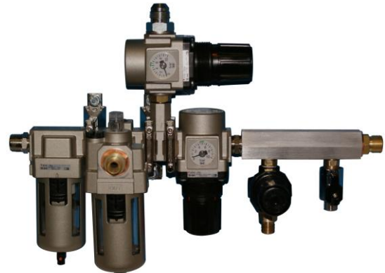
Modified ARF with GAS-EXT-ARF-KIT fitted