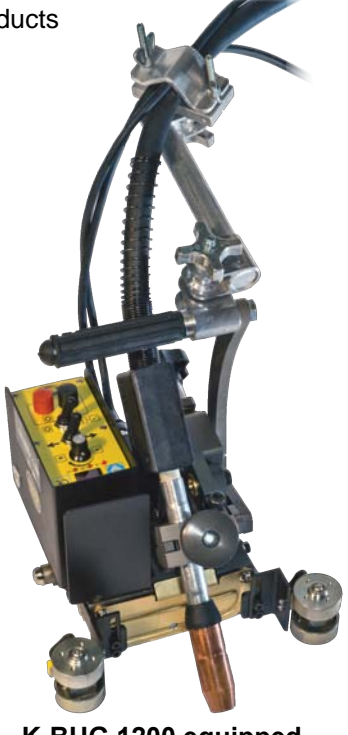
K-BUG 1200 equipped with optional accessories