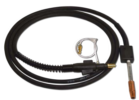
KBUG-1067 Magwheel Add-On Kit Used for welding curved irregular shapes

(B)- Cable Length 15 ft (4.57 m) / 25 ft (7.62 m)