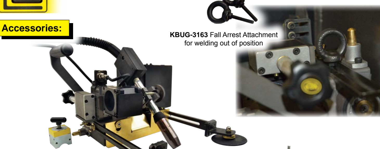
MSQ-150 ON/OFF Magnetic Stop for limit switch activation