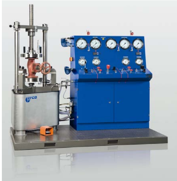
PS-15/-30/-50/-75 (with gantry)

Standard Valve Test Bench for Testing of Safety Valves and Shut-off / Control Valves