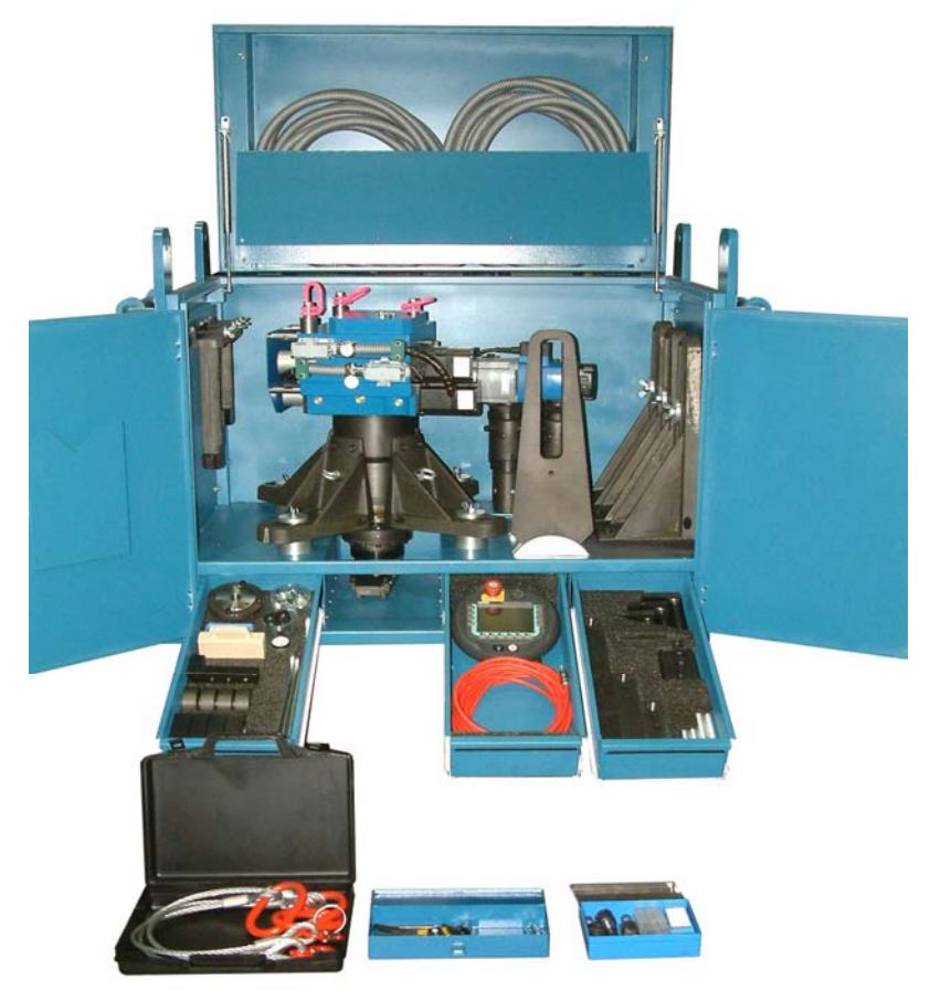
TD-2T in workshop trolley

The machine is supplied with extensive accessories. Machine and accessories are supplied in a practical and robust workshop trolley.